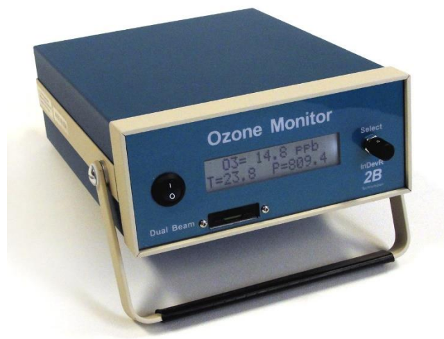
The Model 205 Dual Beam Ozone Monitor

The 2B Tech Instrument's Role: The O 3 measurements on the TRAX trains were made by the Model 205 Dual Beam Ozone Monitor. The portability, quick response time, and high accuracy of the Model 205 enabled the researchers to obtain ozone measurements with high spatial resolution and provided reliable information about differing ozone concentrations along the entire rail line throughout the Salt Lake Valley. If public transit continues to be used to monitor air pollution, the Model 205 will fill a vital role in providing ozone exposure assessments for the public.