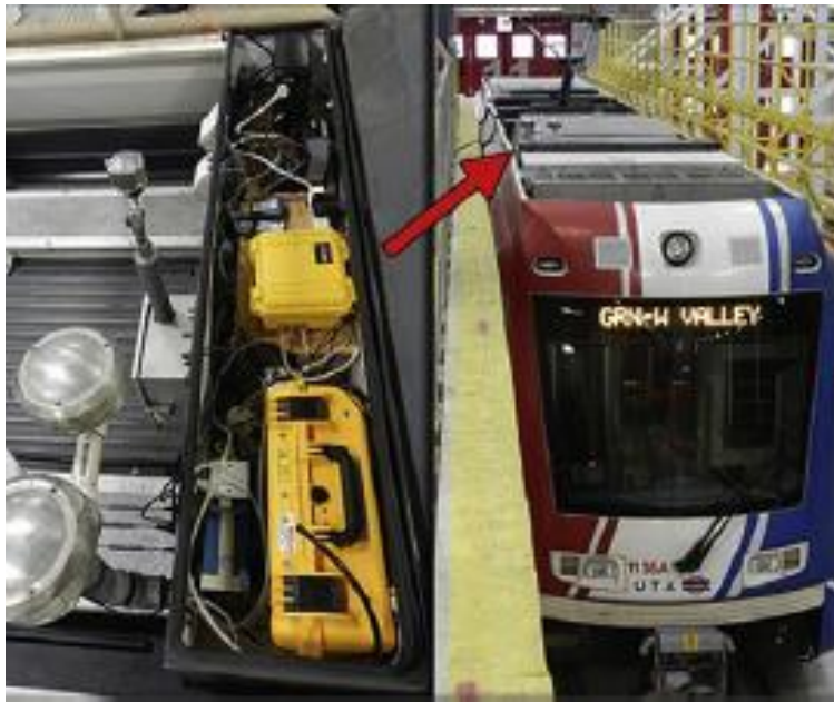
Air Pollution Instruments Installed on TRAX Cars

The University of Utah and the Utah Transit Authority Partner to Measure Greenhouse Gases and Other Pollutants Using Light Rail Cars