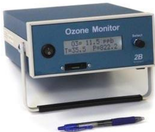
The Model 202 Ozone Monitor

The 2B Tech Instrument's Role: Measurements of the ozone mixing ratio during both legs of the cruise were made by the Model 202 Ozone Monitor. The instrument is equipped with an internal Nafion assembly called a DewLine which allows the instrument to eliminate any potential water vapor interference from the ozone measurements. This was very important in the context of this study as the humidity was high while sampling at sea around the Arabian Peninsula. The Model 202 is approved by the US EPA as a Federal Equivalent Method (FEM) for measuring ambient ozone concentrations, allowing the instrument to provide highly accurate measurements in the ppbv range experienced around the Arabian Peninsula. The low power requirements and portability of the Model 202 also made the instrument uniquely suited to be deployed in the remote setting on the Kommandor Iona .