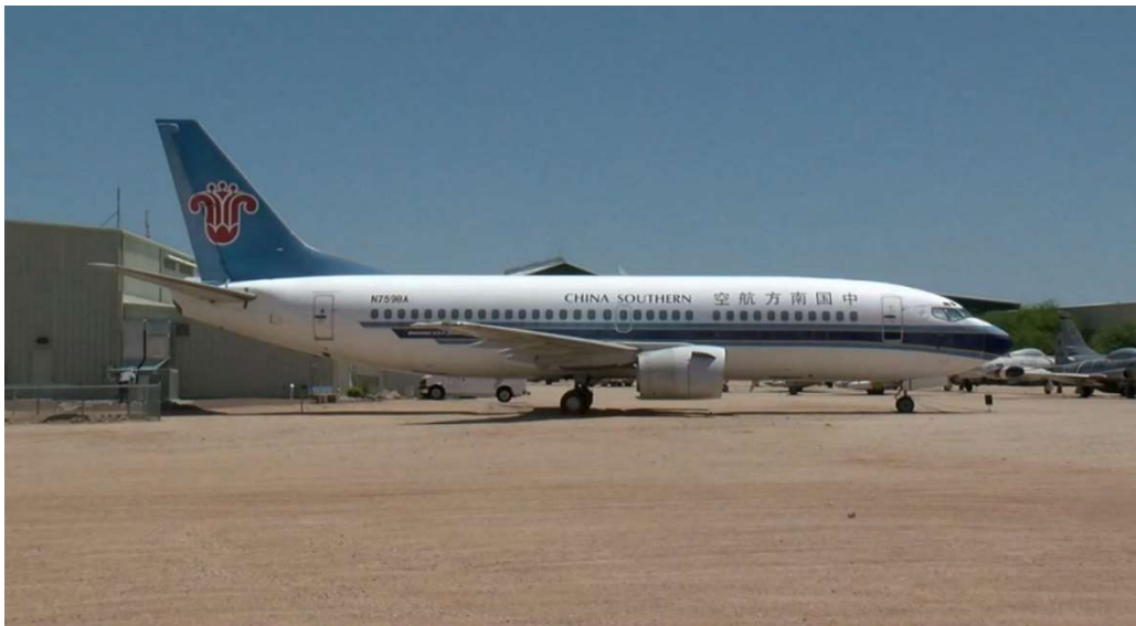
Boeing 737 used for the ozone disinfection experiment

The Solution: Energy Quest Technologies decided to try a new approach to cleaning airplanes. Energy Quest Technologies is a Chandler, AZ based manufacturer of portable air conditioners. They knew pumping ozone into the plane through its air conditioning system could be the solution. Airplanes are inherently airtight, providing the perfect conditions for ozone treatment.