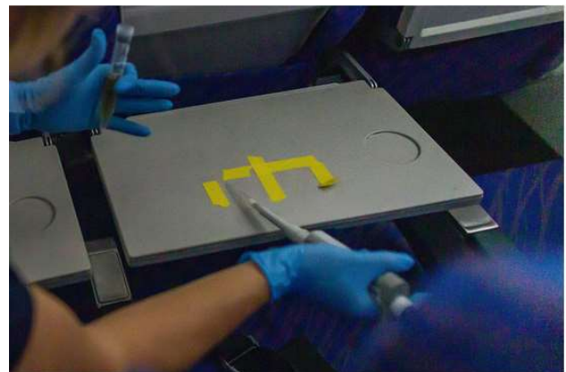
Virus is pipetted onto tray table for testing

The 2B Tech Instrument's Role: The Model 106-L monitored the ozone concentration throughout the aircraft sterilization process. The portability of the instrument allowed the ozone monitor to be located inside the aircraft cabin during the testing. Here the Model 106-L could measure the concentration to ensure ozone reached a critical level to achieve 99.9999% reduction of virus.