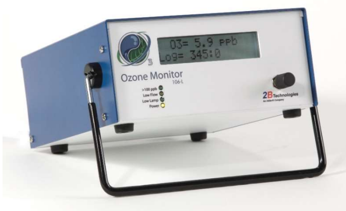
2B Technologies' Model 106-L Ozone Monitor

Click here to learn more about Energy Quest's Aircraft Sterilization System: https://energyquesttech.com/aircraft-sterilization/